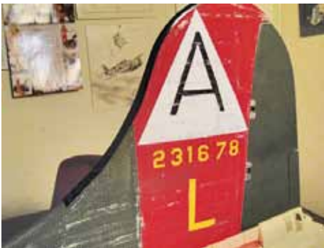
B-17 Fresh paint