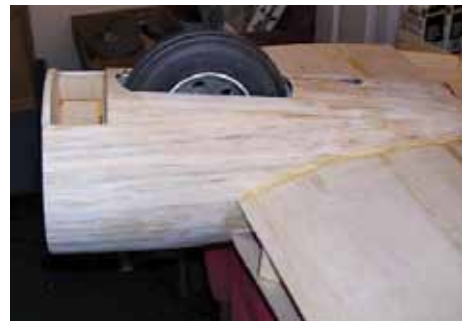
B-17 Tire down start 2