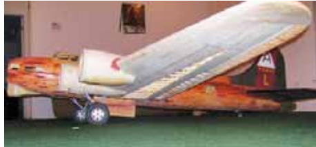
B-17 First time ground view