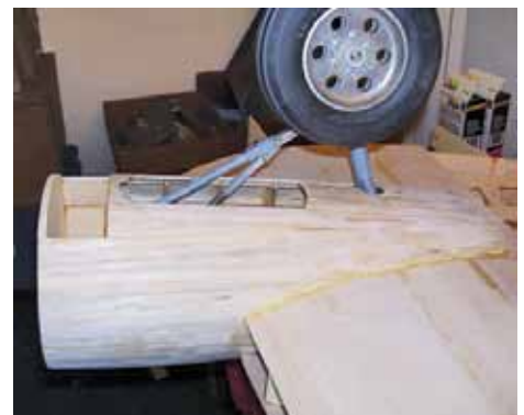
B-17 Gear start 2 with tire