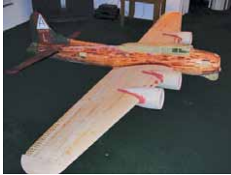
B-17 Right side high

This is the first time she's been on the gear, all assembled, only 300,000 rivets, paint interior, bomb rack, radio and more to go, HALF WAY THERE!!