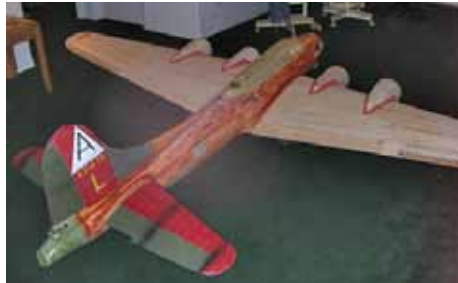
At left: B-17 First time overview right