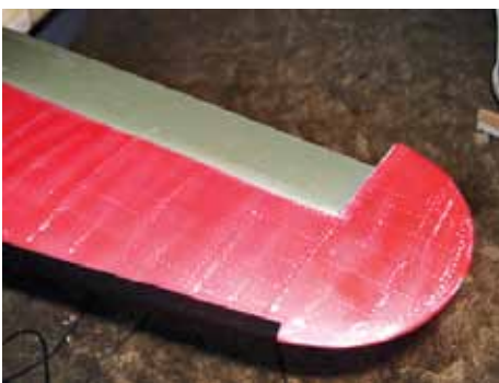
B-17 Elevator painted