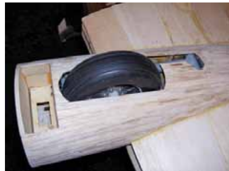
B-17 Overshot of main gear