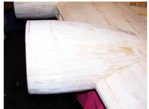
B-17 Nacelle hatches in