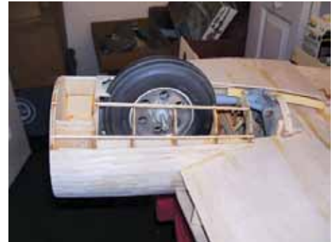
B-17 Gear up, not sheeted