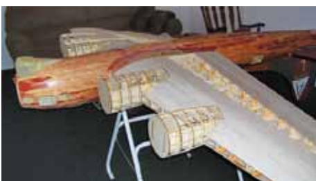
B-17 Bottom, stage 4