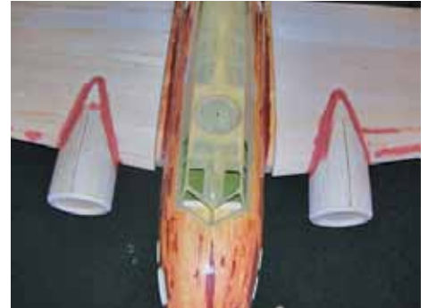
Above: B-17 Top of cockpit area