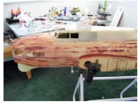
B-17 Nose, pre-primer