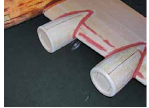
B-17 Left nacelles